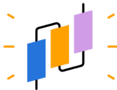
Qvidian Library Basics