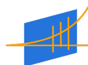
Qvidian Reports & System Settings